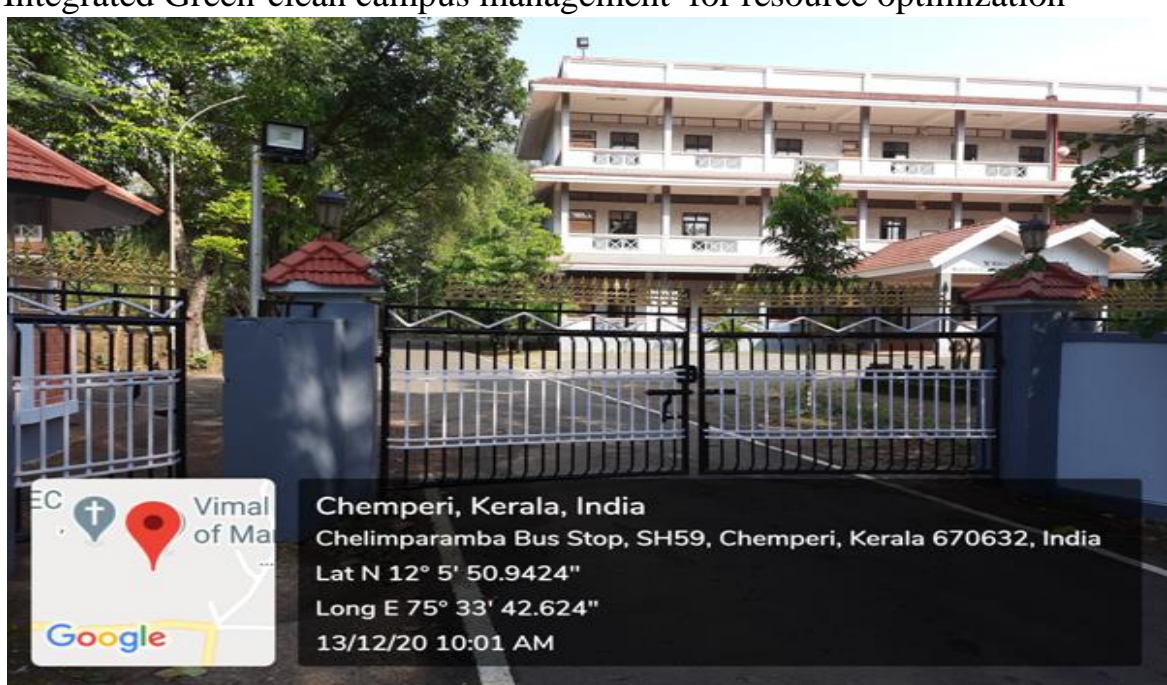
Entrance to the Institute- Green Clean Campus